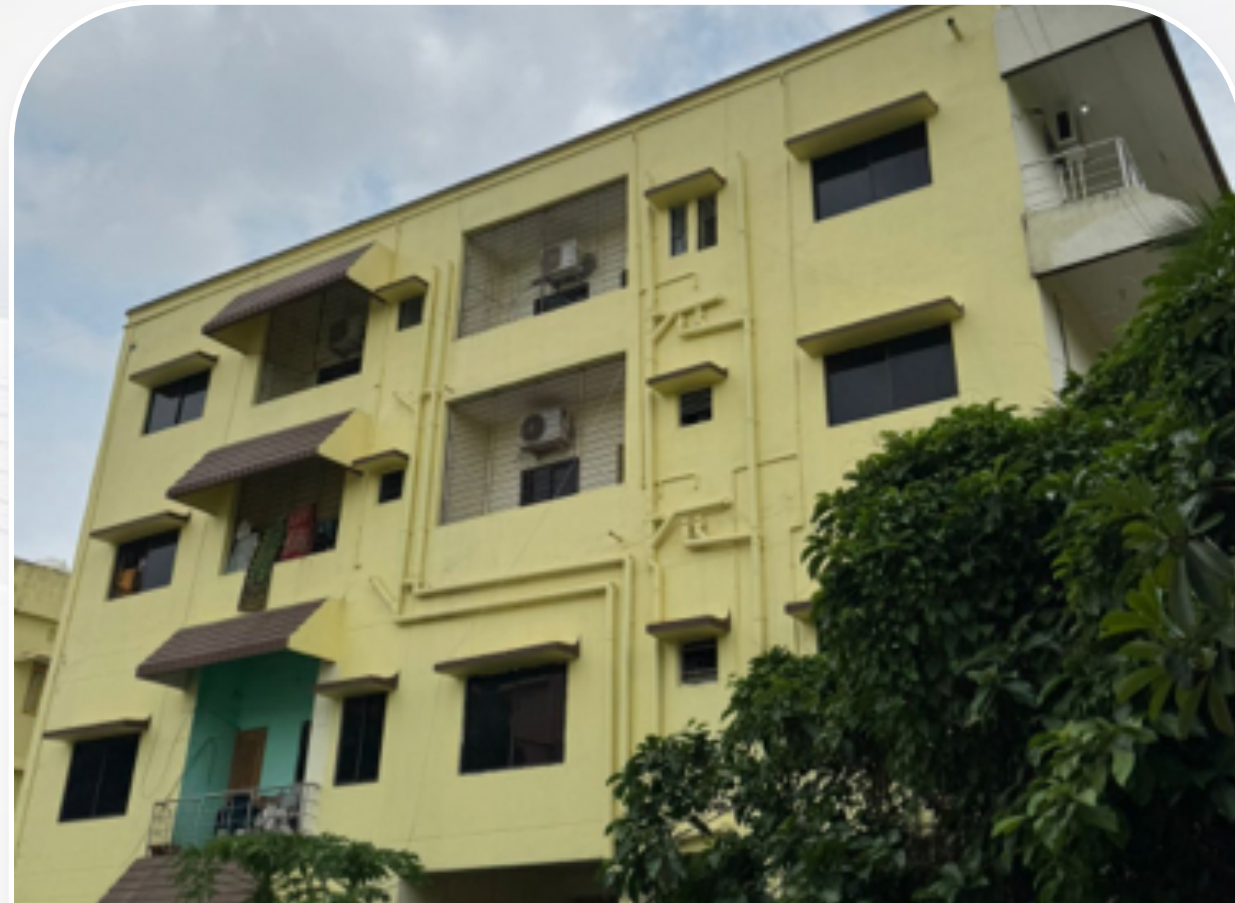
Building Project, Kaling Nagar, BBSR