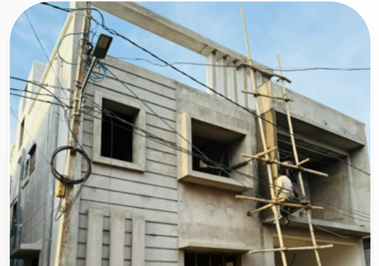
Sri Balaji Guest House, BBSR