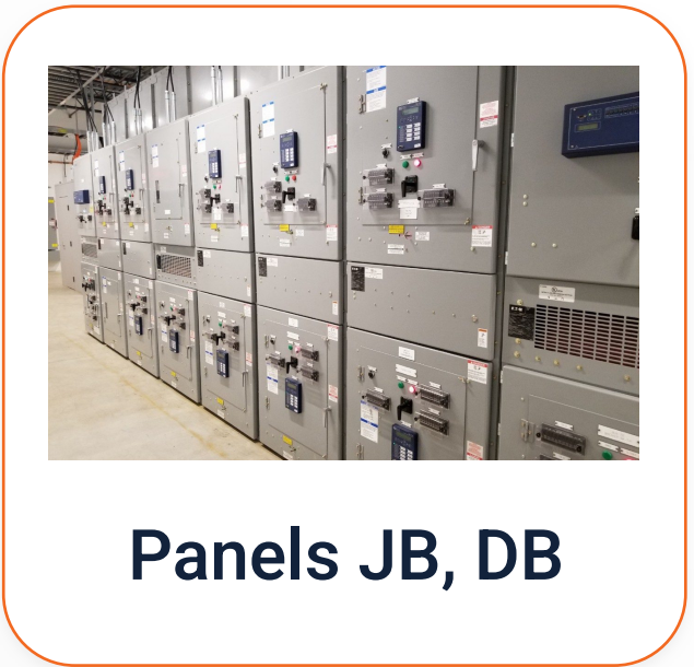
Panels JB, DB