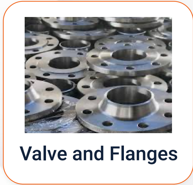
Valve and Flanges