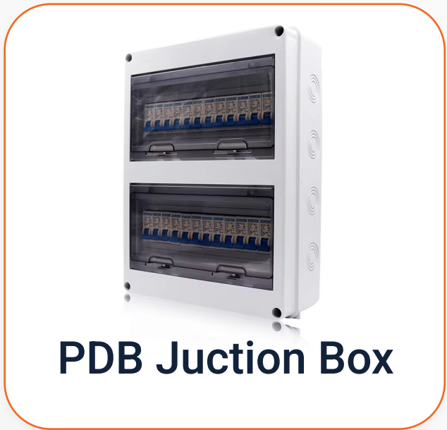
PDB Junction Box