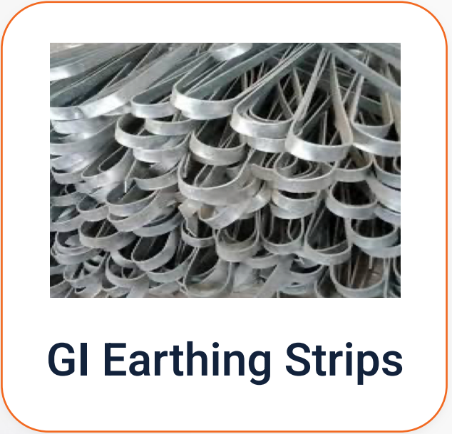
GI Earthing Strips