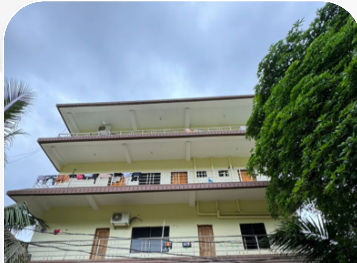
Utkalika Homes, Kalyani Nagar, BBSR