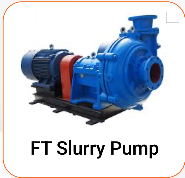
FT Slurry Pump